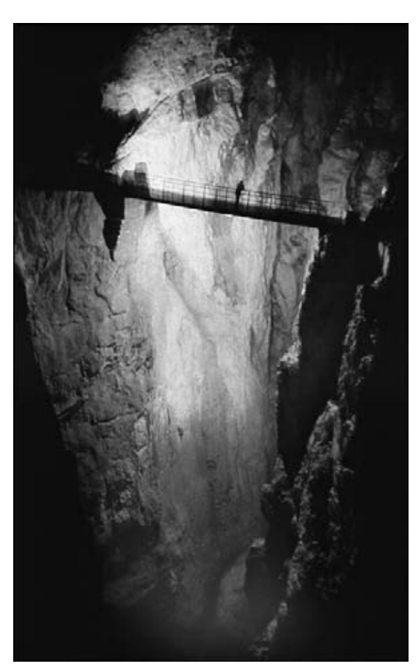
The tourist trail bridge over the underground canyon.