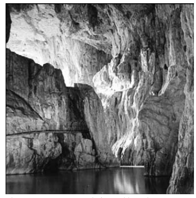
The river passage just inside from Velika Dolina.

The view eastwards across the Velika and Mala collapse dolines, with Skocjan village church on the cliff above the upstream segment of the Skocjan cave.